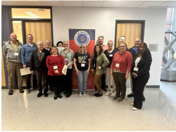
De Sales University, D 7430, Lehigh Co., PA, March 23, 2024