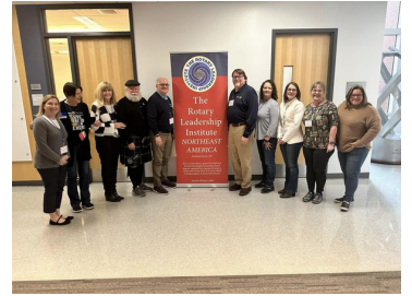
Bourne, MA, District 7950 on March 23rd